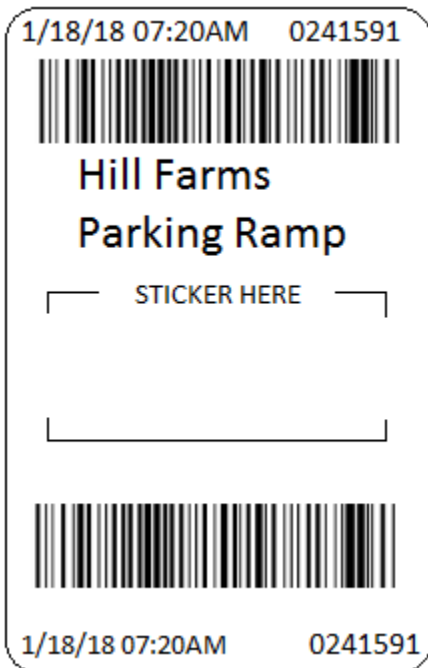
Example of a Visitor Ticket

The parking management system has validation functionality. Agencies may request validations be programmed into the parking system. Validations may be full or partial. A full validation will pay the entire parking fee for a visitor. A partial validation will pay a set amount of time for a visitor. (example: 1 hour = $2.00) The agency would be billed monthly for visitor validations utilized. The agency requesting validations will receive stickers programmed to the agency account. The validation sticker will be placed on the parking ticket as shown below. Please contact the DOA Parking Administration & Management Group to request parking validations for your agency.